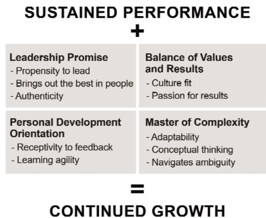
Figure 2: Four key areas that indicate leadership potential.

DDI's Leadership Potential Inventory process can help you identify potential effectively, focusing your investment on those individuals who will generate the highest ROI in terms of their ability to grow quickly and broadly. Based on our experience, the factors that comprise potential are very difficult to develop. DDI's research on this topic yields four key areas that indicate leadership potential: leadership promise, personal development orientation, a balance of values and results, and a mastery of complexity (See Figure 2).